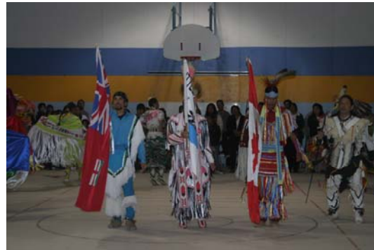
Pow Wow, Little Grand Rapids

Archaeological sites have been predominantly found along waterways and well-travelled trails in the region. In the region, as well as the project area, more sites have been found in the south and east as the northern areas are generally less accessible. North and east of Berens River, 11 pictographs, two (2) campsites and one (1) historic site have been found. In the general area from Bloodvein First Nation to Hollow Water First Nation, two petroforms, one (1) campsite and one (1) isolated find have been recorded. (Bulloch et al. 2002)