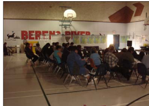
Berens River Community Meeting

The engagement with local First Nations communities and Northern Affairs communities in this area provided a framework to this project. The Province established the East Side Road Authority (ESRA) and charged it with the responsibility to manage the ASR Project, which involves upgrading the portion of the existing Rice River Road from PR304 to the Bloodvein River, and a new road alignment onwards to the Berens River First Nation.