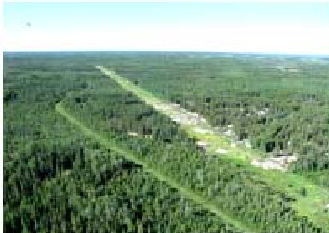
Existing Distribution Line and Winter Road, South of Berens River

The evaluation of the Natural Environment Criteria Category identified little significant difference in the actual number of water courses crossed by the three routes. Each route crosses three rivers requiring bridge structures more than 30 m in length. The Inner Shoreline requires the largest number of moderate-sized bridge structures ranging between 15 and 30 m in length. The Shoreline Route has the greatest number of bridges with multiple spans that require piers to be placed in the watercourse. The Central Route crosses the most wetland (shrub & herb) habitat and more open coniferous forest that presents habitat conditions favourable to woodland caribou. The Central Route would result in the highest disturbance to caribou habitat. Overall, despite the potential for more bridge spans, the Shoreline Route was favoured from the natural environment perspective as it does not cross critical caribou habitat, and any adverse effects to fish habitat from waterway crossings are considered to be mitigable.