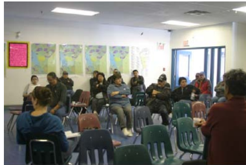
Poplar River Community Meeting

Round One (April to July 2009) initiated dialogue about the proposed Project, introduced ESRA as the project proponent and the EIA process. A description of the proposed Project and routing options was provided and input was obtained on the proposed Project for the EIA. Communities engaged, included: