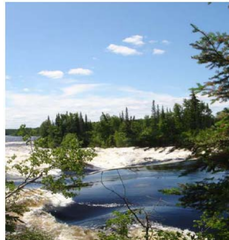
Little Grand Rapids

The Project area typically experiences short warm summers and very cold winters. There is no ambient air quality data available for the Project area as there is no continuous air quality monitoring station in that zone. In general, Manitoba air quality is good and the air quality in the study area is presumed to be very good due its remoteness from industrial sources.