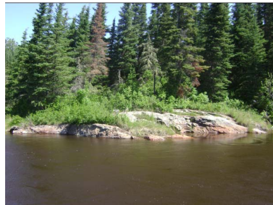
Berens River Bridge Site North Side

Construction phase activities are expected to commence in the fall of 2010, and should last approximately 42 months, with substantial completion targeted for March 2014.