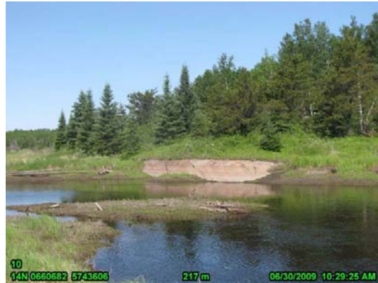
Proposed Steeprock Creek Crossing Location Near Hollowater First Nation

The aquatic biology assessment focused on the evaluation of the fisheries habitats and fisheries resources with respect to: