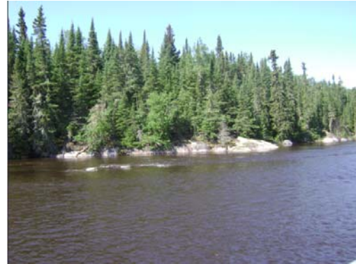
Berens River Bridge Site South Side

The proposed Project may be at risk of flooding due to seasonal flood events. However, the Project design standard of 1:100 year flood event for crossings is intended to limit the potential for flood damage and washouts at crossings and along the road network. In addition, the road will also include regular road side drains and culverts to accommodate seasonal drainage.