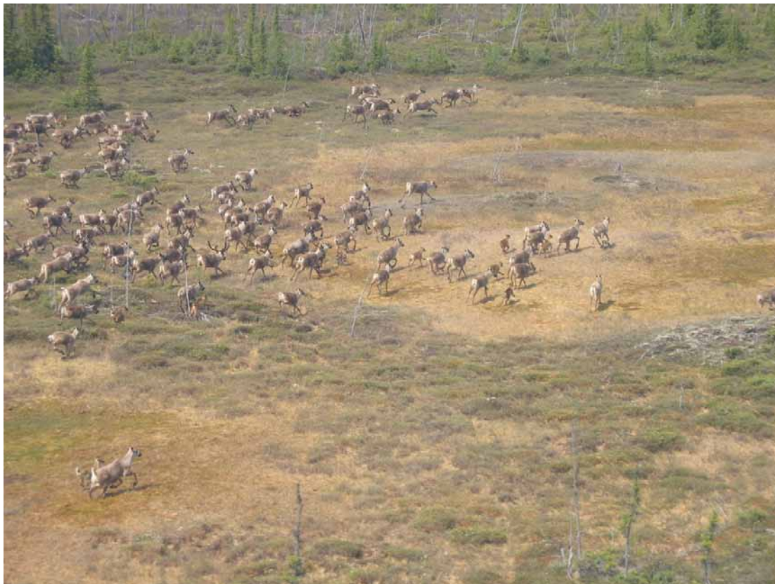
Photo 7-2 shows the largest grouping of coastal caribou observed inland, and in proximity to the Keeyask area. Possible causes of the shift in distribution from the Hudson Bay coast in Manitoba east to Cape Henrietta Maria in Ontario include habitat change, disturbance, nutritional stress due to range deterioration, and increased mortality due to differences in hunting and predation pressure across the range (Abrahams et al. 2012). Summer use of the Keeyask region is described below, including cases where Pen Islands caribou appeared to be calving in the Stephens Lake area.

Aerial surveys of known calving grounds along Manitoba's Hudson Bay coastline indicate that summer residency has declined in the province, and some animals may have moved inland (Abraham et al. 2012).