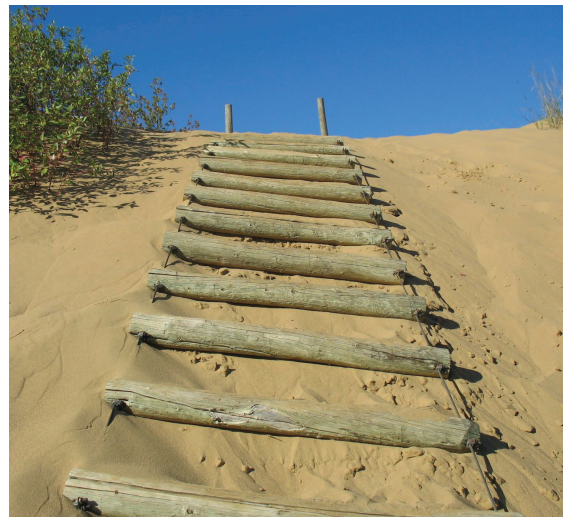
Dune Ladder (Spruce woods): credit - Ann Van Huffelen

Distances indicated on the map are measured from trail junction to trail junction. Visitors may choose the combination of trails and distances that suit their outing. Allow at least 20 minutes for each kilometre.