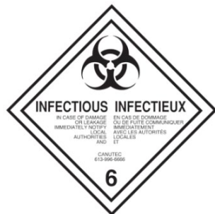
An illustration of Class 6.2, Infectious Substances Label

Specific details on the packaging requirements and specifications to ship infectious substances are available from the TDGR.