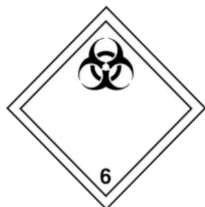
An illustration of Class 6.2, Infectious Substances Placard