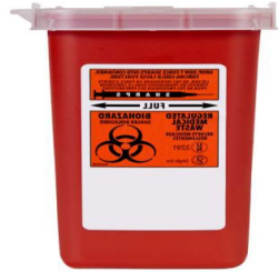
An image of a sharps container

When waste cannot be treated on-site, it must be sent off-site by transporters to facilities licensed or permitted to accept those specific waste types for interim storage or treatment and disposal.