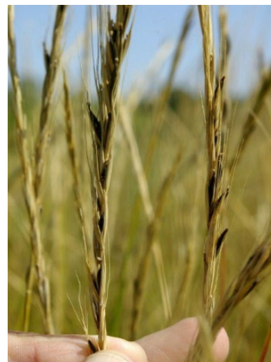
Honeydew spore stage on quackgrass Ergot bodies formed in maturing quackgrass

If there are patches of quackgrass within a field, ergot bodies will be found on the heads of cereals well beyond the field margins. Ergot bodies in infected grain are often harvested with the crop, especially those that are a similar size to the healthy kernels. Larger ones are often knocked loose and fall to the ground. The stepwise infection of grasses first, then cereals, occurs because the ergot bodies germinate long before a spring-seeded crop is in flower.