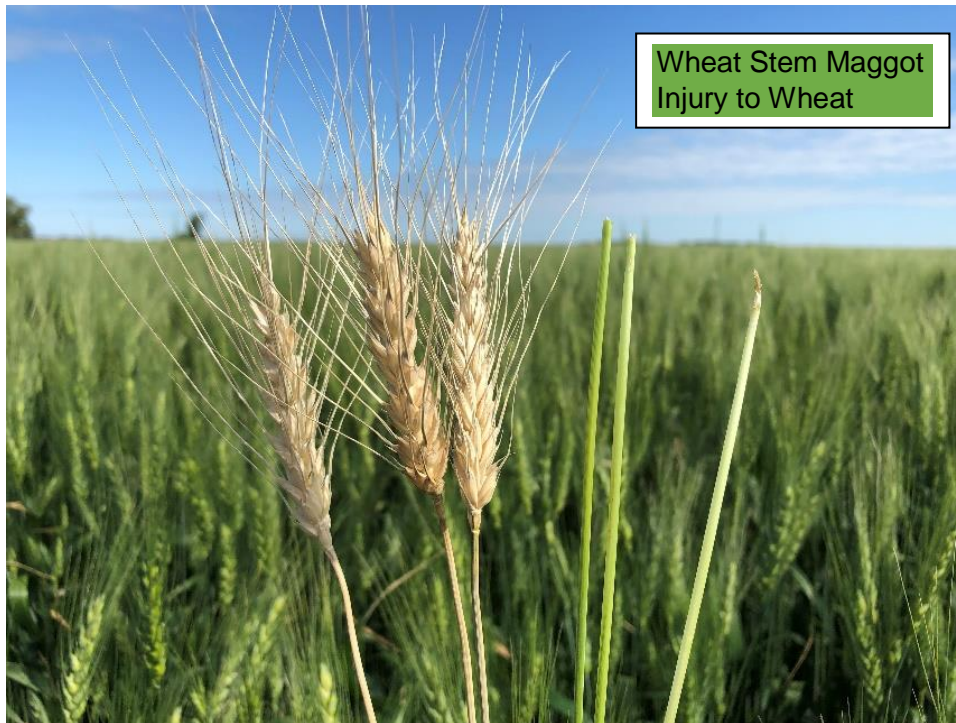
Wheat Stem Maggot Injury to Wheat

Wheat stem maggot: Some have been noting a few white wheat heads in their fields. There are many potential causes of white heads in cereal crops, one being wheat stem maggot. If wheat stem maggot is the culprit the head will pull out with a gentle tug, and usually there is evidence of insect damage (chewing) on the stem above the top node. Plant material below where the stem was severed will still be green. There is nothing you can do when you see these white heads. Insecticide applications are not an option for wheat stem maggot. Yield losses are usually not great, but because the white heads are so visible it can often look concerning yet represent only a very small yield loss.