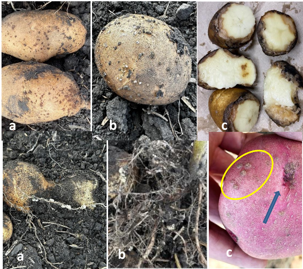
Fig.3. Tuber diseases. a: Early black scurf, b: lenticel enlargement in high moisture soils; c: Early soft rot in newly harvested tubers.