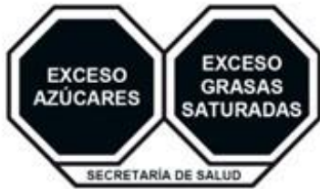
a) Two seals